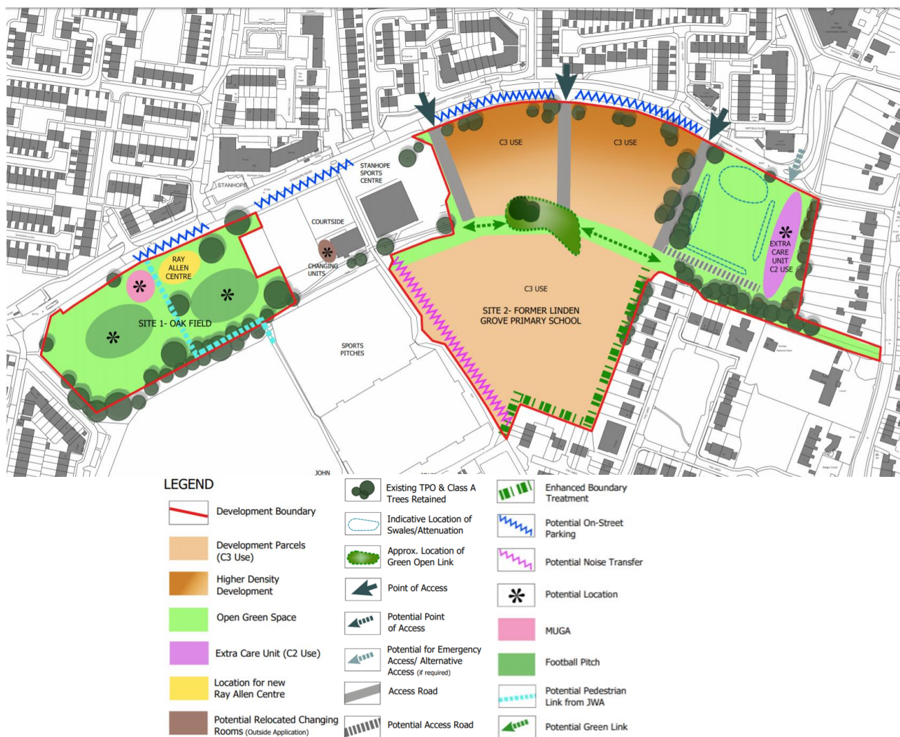
Fig 3 Proposed Accesses

access ways into or through the site are all reserved matters for consideration at a later date should outline planning permission be granted.