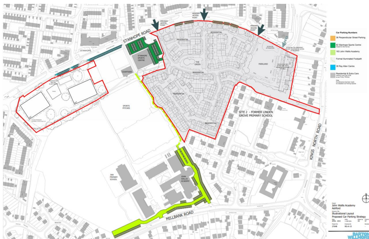
Figure 5 - Indicative layout showing location of proposed parking provision

As the new parking is outside the site boundary the new parking is not shown on the illustrative layout or parameter plan, however it shown on the plan below in figure 5.