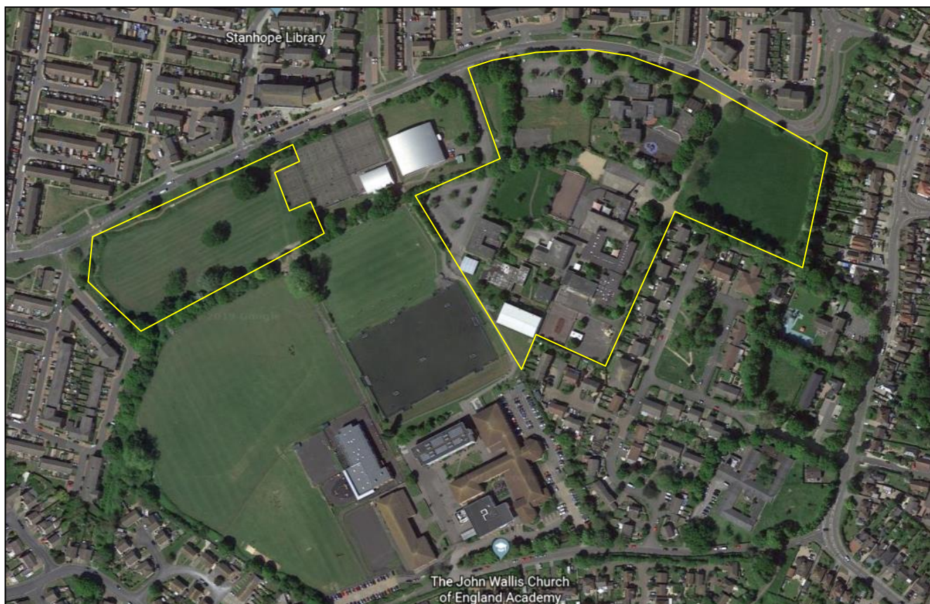
Figure 2 – Aerial photo of the site