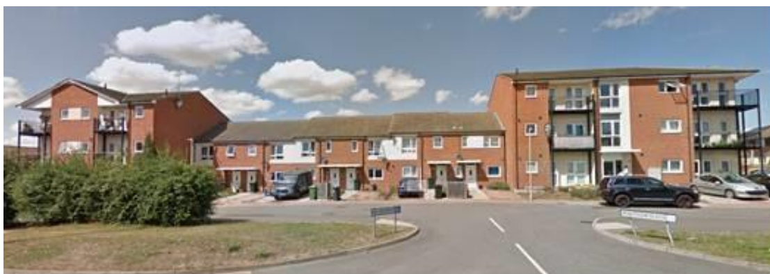
Figure 7. Density Area A