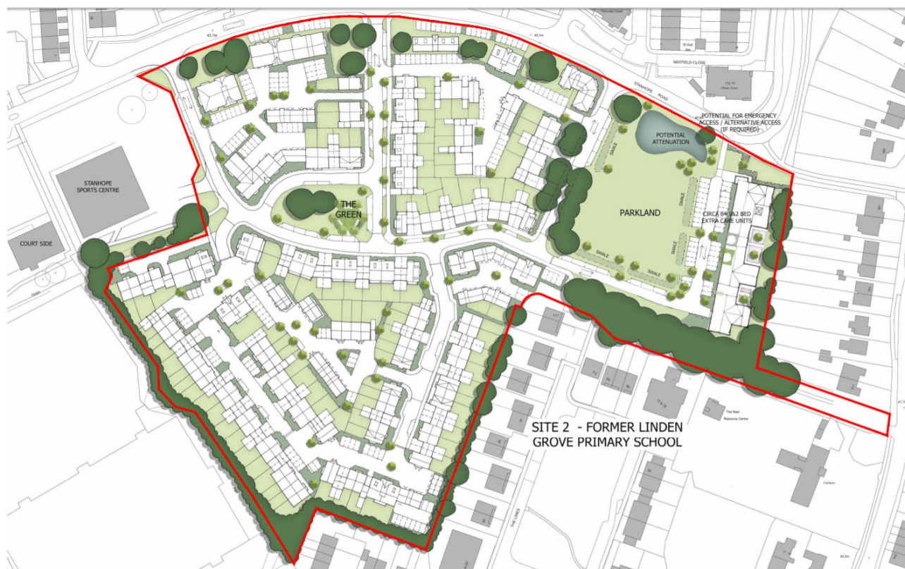
Figure 6 - Site 2 Indicative Layout