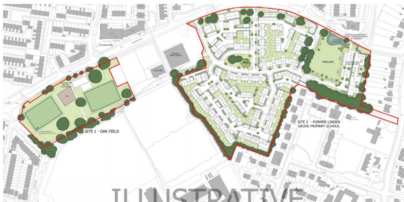
Figure 4- Illustrative Layout