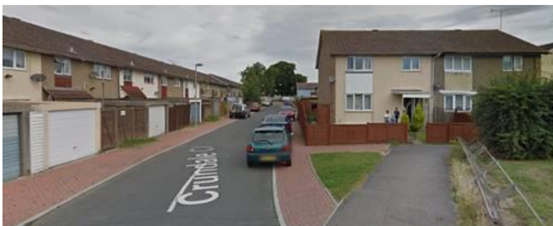
Figure 8 -Density Area B